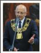
Krzysztof Żuk Mayor of Lublin, Poland - Keynote Speaker