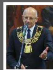
Krzysztof Żuk Mayor of Lublin, Poland - Keynote Speaker