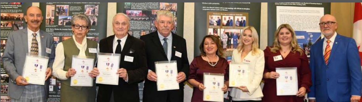
The Board of Directors of the PCBPAW