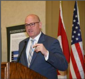
Drew Dilkens, Mayor of Windsor