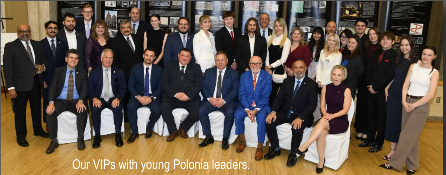
Our VIPs with young Polonia leaders.