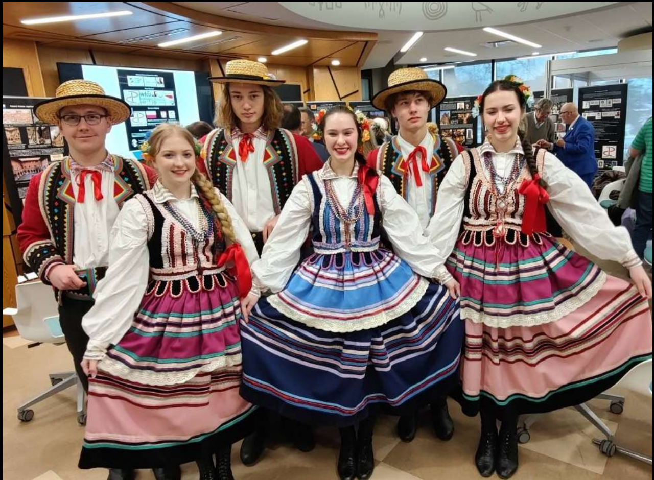
“Tatry” Song and Dance Ensemble