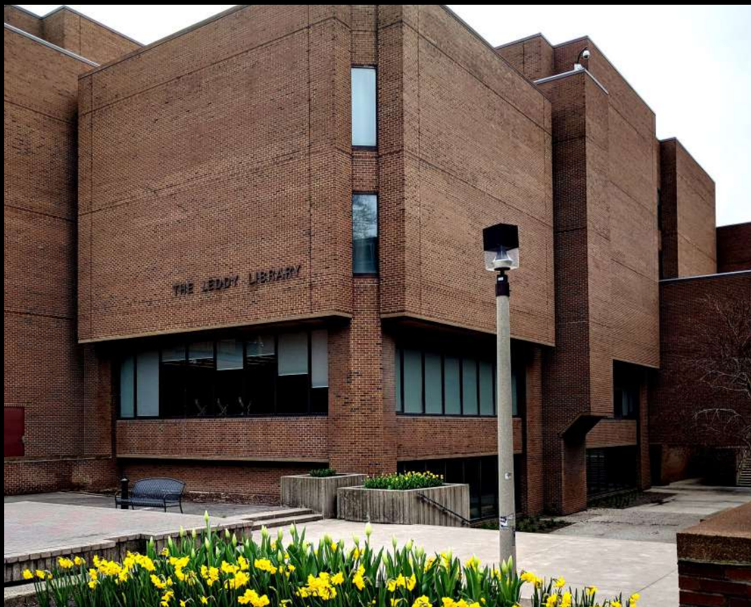
The Leddy Library, University of Windsor.

The official National Inauguration of Copernicus Jubilee (550) in Canada, including the Copernicus Display, with a ribbon-cutting ceremony, took place in the Leddy Library, University of Windsor.