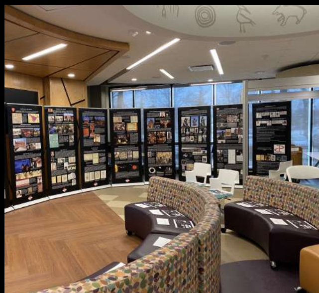
The Copernicus display at the Leddy Library, University of Windsor.