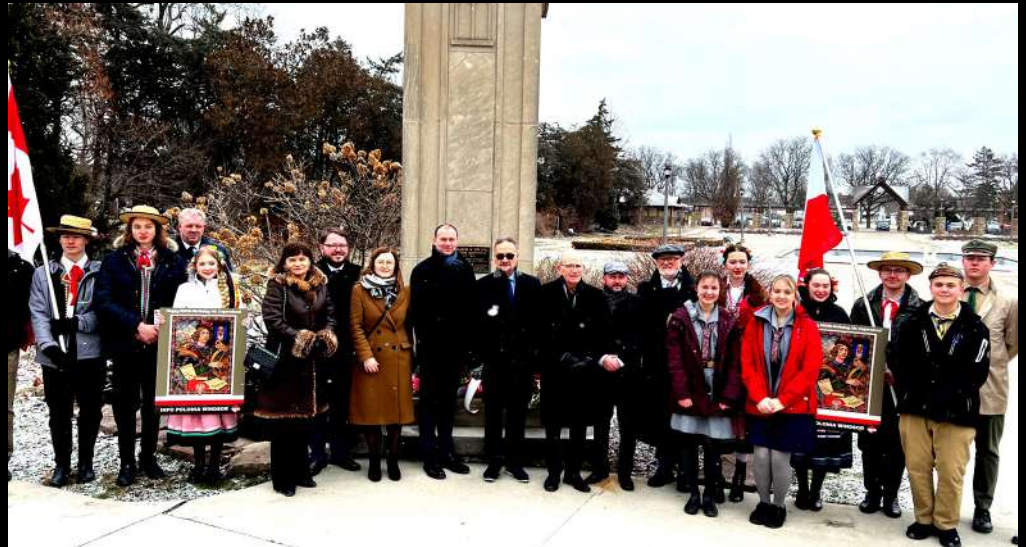
VIPs with members of the Polish Community, "Tatry" Song and Dance Ensemble and local scout groups.