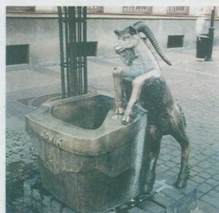
SISTER CITY: The famous goat drinking fountain in Lublin, Poland—Windsor's twin city. A replica will be installed on the Windsor riverfront.

The exhibit at the Windsor Community Museum, 254 Pitt St. W., is currently on display and runs through the 100th anniversary week.