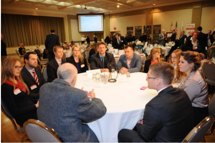
Meeting of young people with Hon. Howard Pawley

The young Polonia leaders, taking advantage of the presence of the distinguished guest, the Hon. Howard Pawley, former Premier of Manitoba, held an interesting “roundtable” meeting with him. During the course of the conversation, he revealed that his wife has Polish roots. In the programme for the evening, the Premier had an additional opportunity to direct some words of recognition publicly to the young leaders for their attention to politics and their interesting discussion, as well as to the organisers and their support for youth.