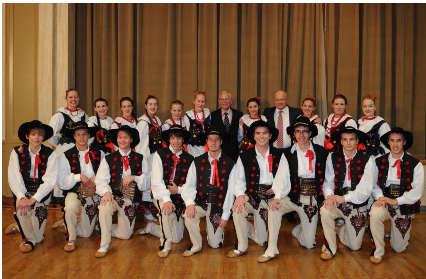
Song and Dance Ensemble, “Tatry”