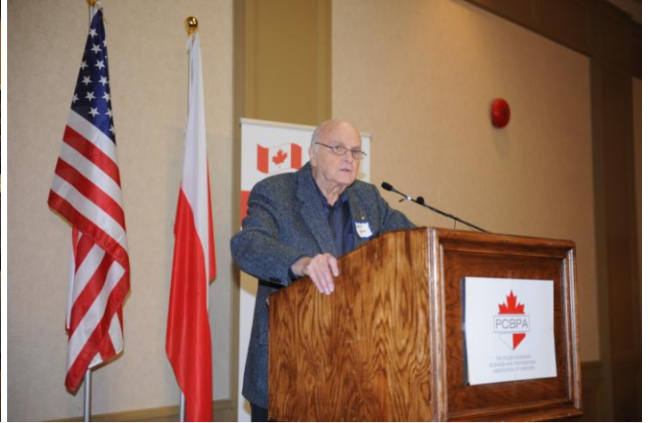
Hon. Howard Pawley