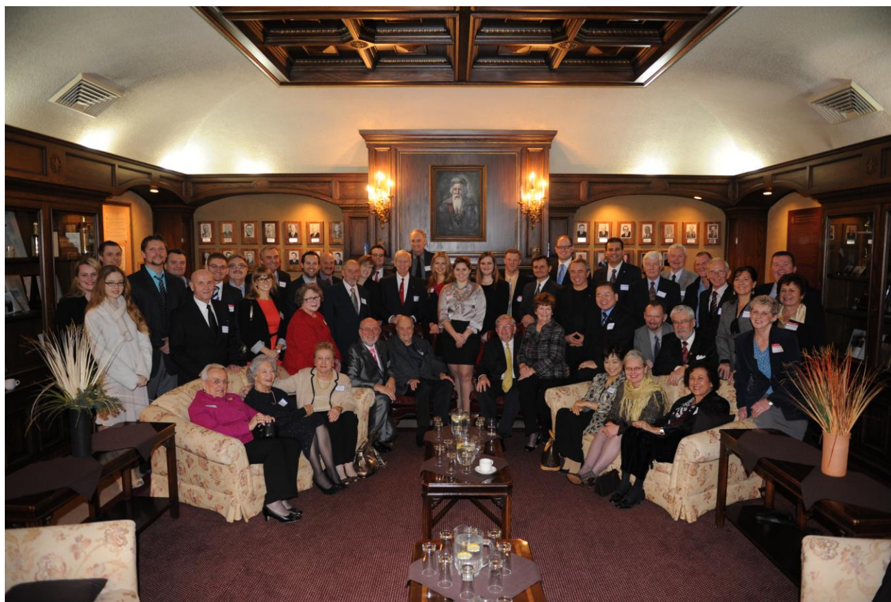
Gathering of VIPs

The evening began with the traditional reception for VIPs, during which participants were able to meet, renew contacts and take photographs as keepsakes.