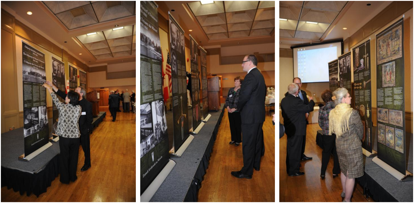
Exhibition The Odyssey of the Wawel Treasures, 1939-1961